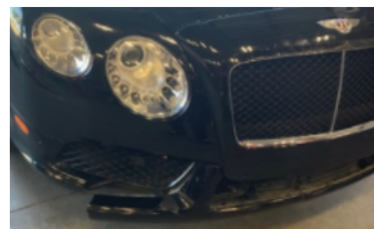
A 2013 Bentley Continental GT had a damage bumper which cost $18,442.

(click the Dokshop login below if you need a new or replacement guide)