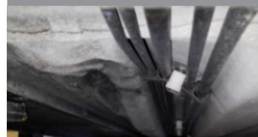
A 2016 Nissan GT-R was jacked up in the wrong spot which cost $13,228.