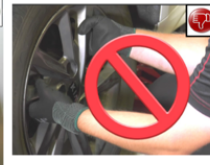
LIFT BY SPOKES