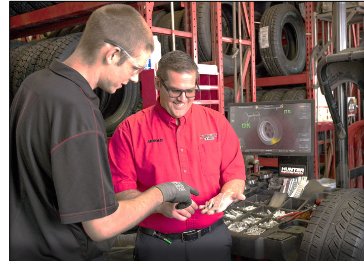
Certified In-Store Service Trainers

Interactive Learning process accomplished by “TELLING and DOING”